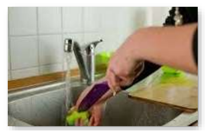
Don't Put in Sink Make sure you wash your knives one at a time by hand. NEVER put in sink of soapy